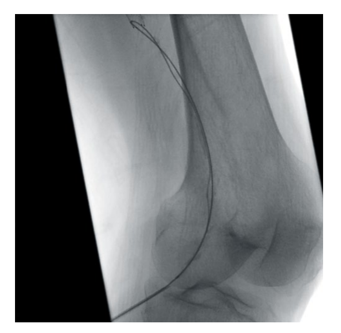
Popliteal artery access under ultrasound, chronic total occlusion crossed through previously placed stents with guide wire

At the end of the procedure the patient had palpable 2+ pulses in the dorsalis pedis artery. In the recovery room, the patient stated she had complete relief from the pain in her lower left extremity.