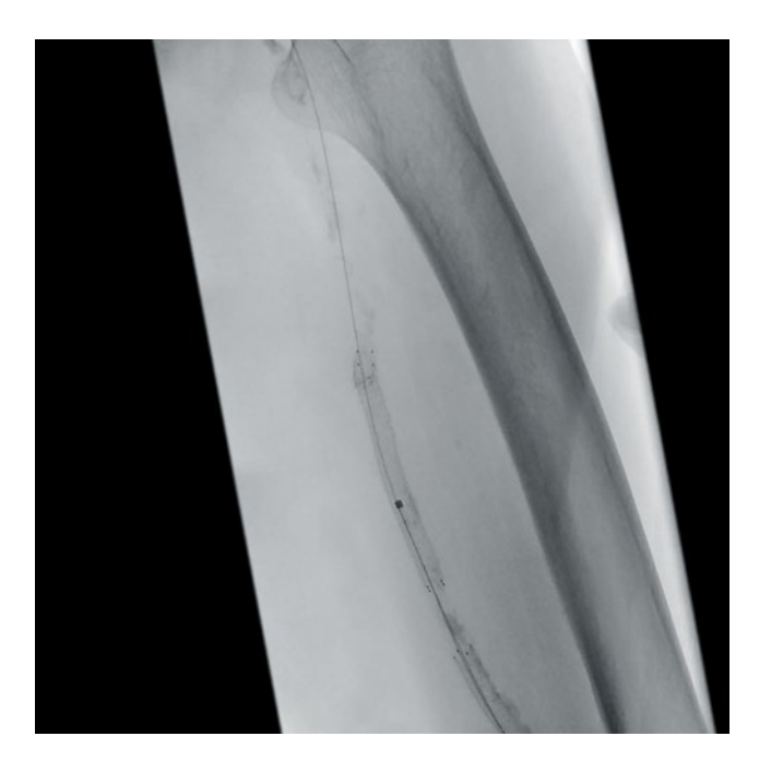
Laser artherectomy performed in-stent restenosis