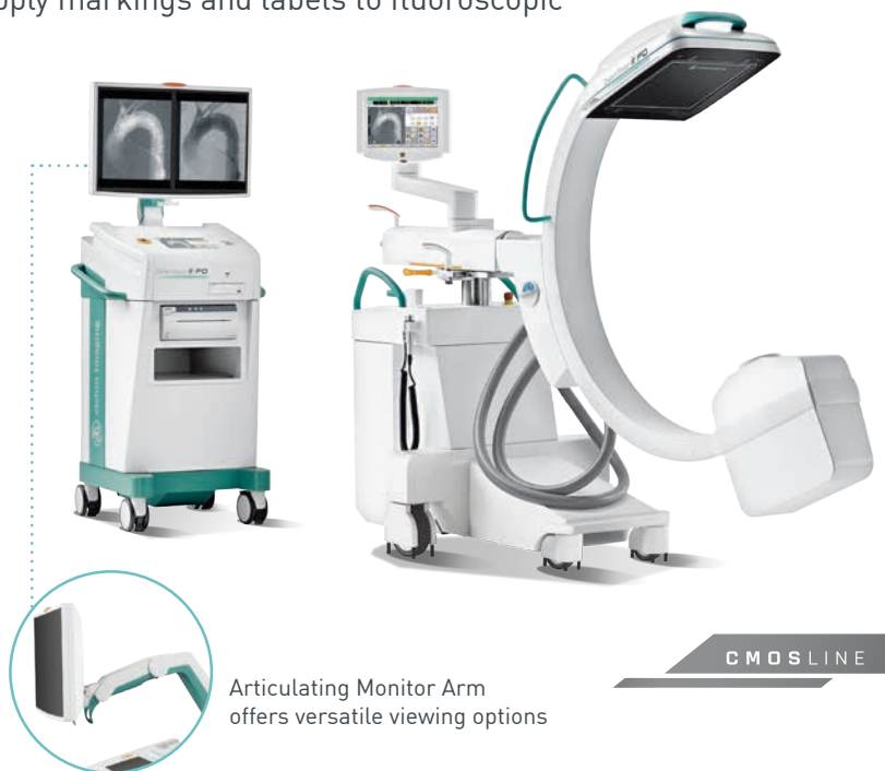
Articulating Monitor Arm offers versatile viewing options