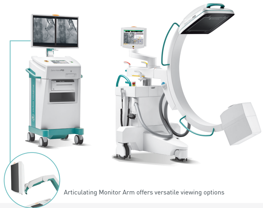
Articulating Monitor Arm offers versatile viewing options